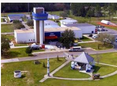
StenniSphere, the John C. Stennis Space Center's visitor center in Hancock County, features a 14,000-square-foot museum and outdoor exhibits about Stennis Space Center, and host about 36,000 visitors a year.

From 1975 until 2009, NASA tested the main engines used to propel the space shuttle on its 8.5 mile ascent into orbit.