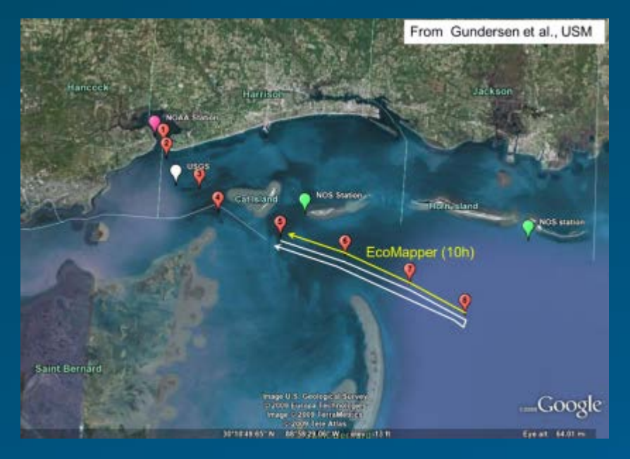
Glider tract planned by USM

• Two attempts were done to fly the USM Glider "Roxy" on the shelf and both failed due to technical complications associated with the extreme density gradients in summer.